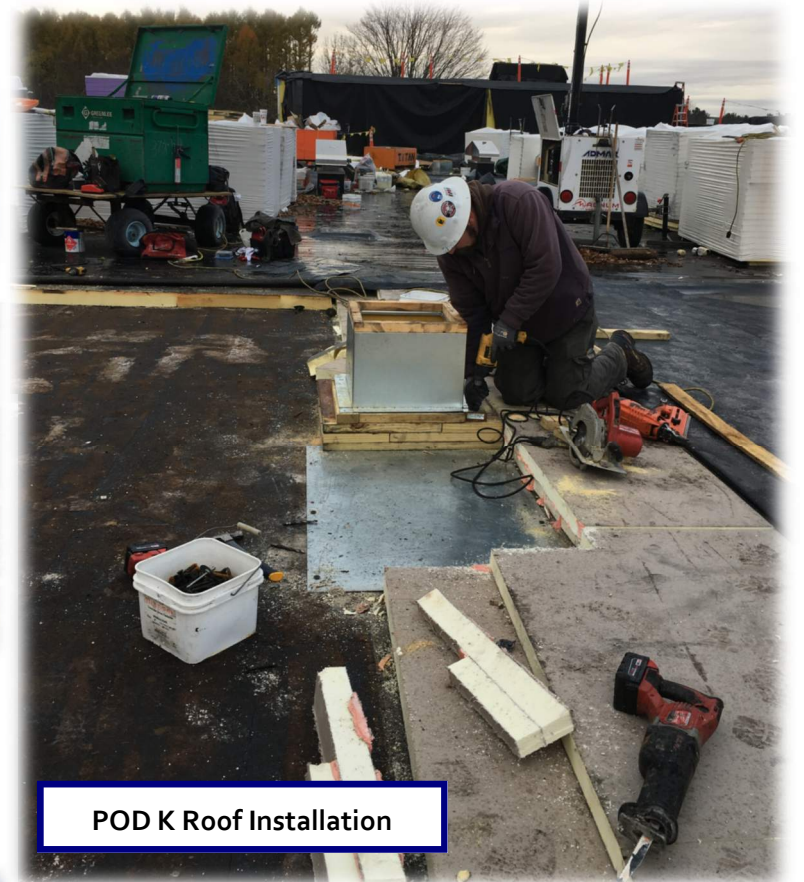
POD K Roof Installation