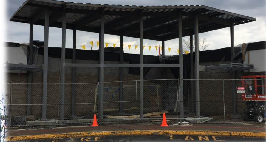
POD J Vestibule Structural Steel