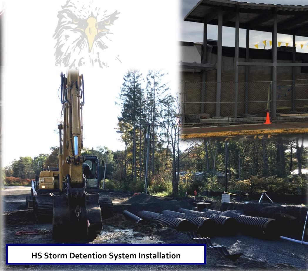
HS Storm Detention System Installation