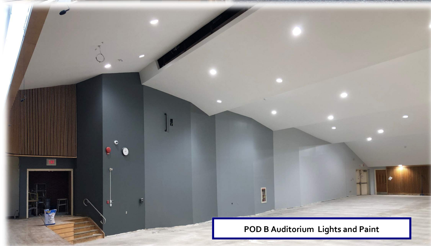
POD B Auditorium Lights and Paint