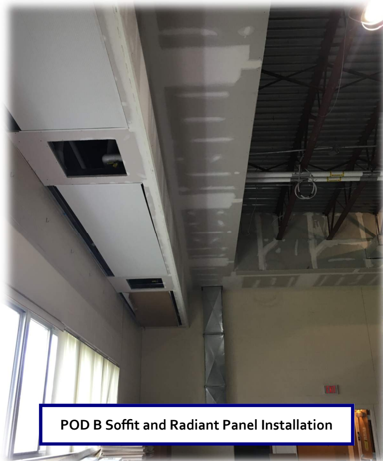
POD B Soffit and Radiant Panel Installation