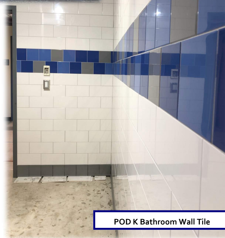
POD K Bathroom Wall Tile