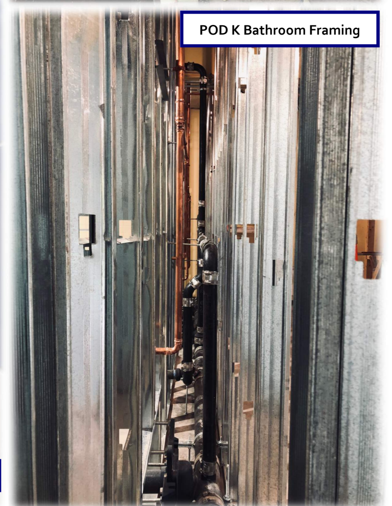
POD K Bathroom Framing